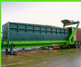
Logs are preloaded into the Tub & Container attached