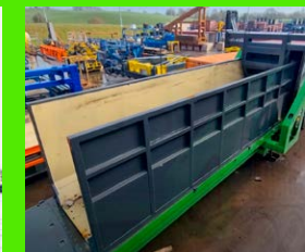
Hatch Opens Up & loaded Container is detached.