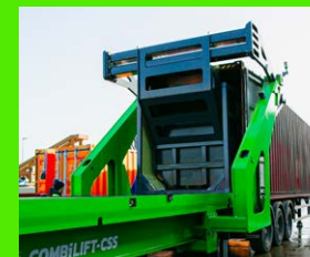
Hatch Locks down & Tub powers out