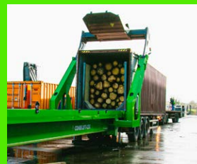
Hatch Closes Down