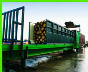
Loaded Tub is powered into the Container