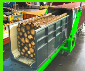
Loaded Tub securely inside Container.